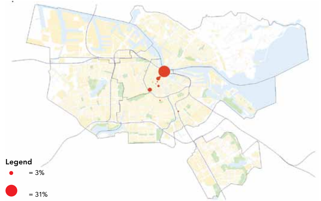
Figure 1: answer to the question to 2600 Amsterdam citizens: What is, in your opinion, the most annoying spot to park your bicycle?

Cyclists still have to pay for the first day they park their bike in a shed but the city council would like the first day of indoor parking to be free. A charge can be levied from the second day to prevent the indoor racks from being unnecessarily occupied for too long (present rate Fietspunt Zuid: 1st day free, 2nd and 3rd days € 0.50 per day, then € 2 per day). The municipality is in discussions with NS to introduce the Fietspunt concept in the short term at the indoor facilities at Amstel Station, currently half empty all the time.